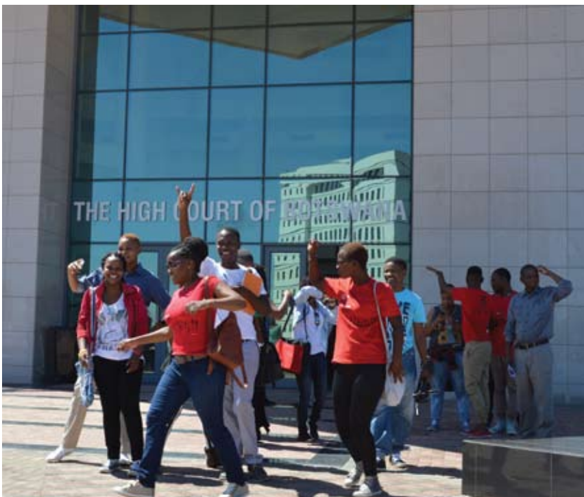
In Botswana, LEGABIBO went to court to challenge the refusal by authorities to register their LGBTI organisation. They won the case.

Partnerships between lawyers and human rights activists have been very successful in many countries in challenging unfair and discriminatory laws. It is worth exploring whether you can find lawyers who are sympathetic to your cause and who will work at a reduced rate or for nothing. Building a long term relationship with lawyers can be an important component of your litigation strategy.