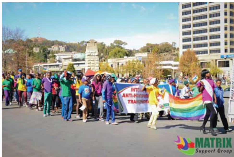
Matrix Support Group organised a march through the centre of Maseru to increase understanding of LGBTI issues by families, friends and the public.